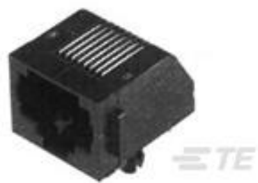
TE Part # 5555248-1 MJ,LPF,R/A,8P/8C,SMT,PNL STOP