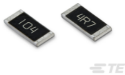
TE Part # 6-2176455-0 CPF 0402 453K 0.1% 25ppm 1K RL