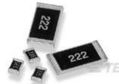
TE Part # 8-1879512-5 CRGH0805 1% 1M0 0.33W