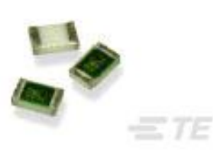
TE Part # 2-1614884-5 CPF 0805 22R 0.1% 25PPM 1K RL