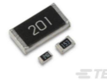
TE Part # 3-2176329-8 CRGP 1210 12K 1%