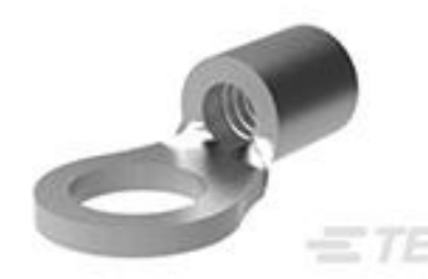
TE Part # 322455 TERMINAL,SOLIS R 12-10 10