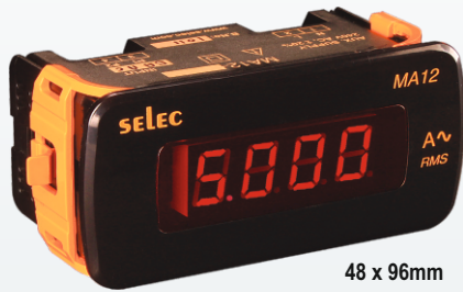
48 x 96mm