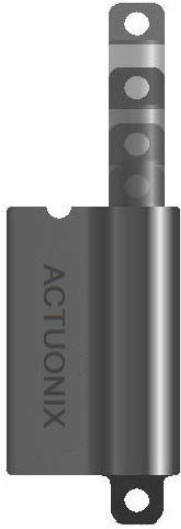
PQ12 Actual Size